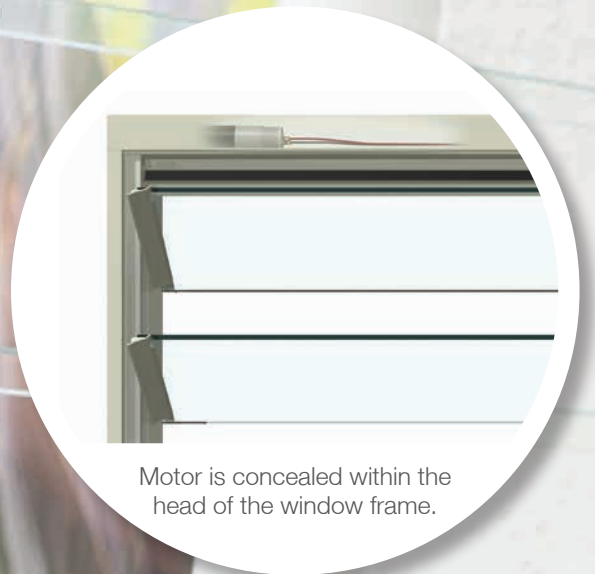
Motor is concealed within the head of the window frame.