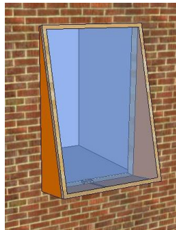
Figure 2b: awning window