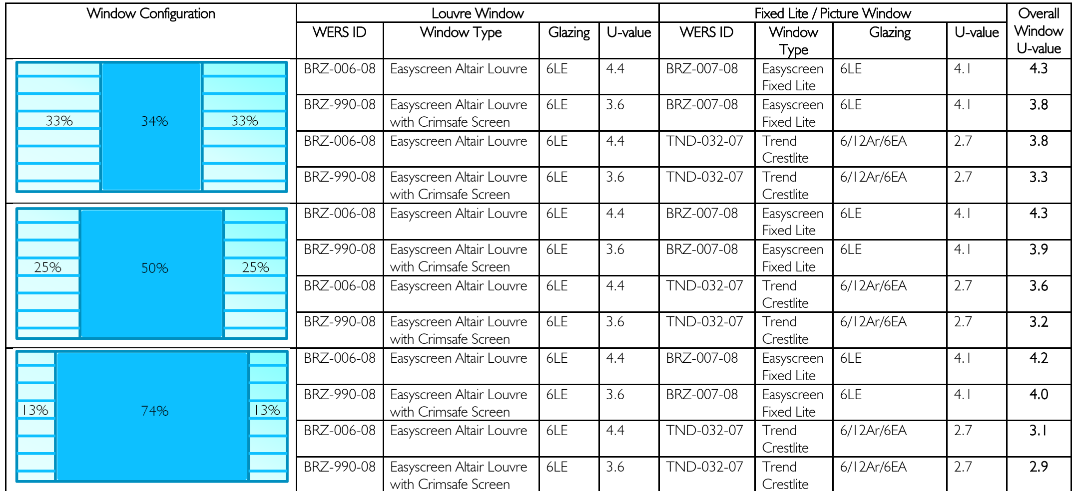
Table 1: Overall Window U-values Of Various Selected Configurations